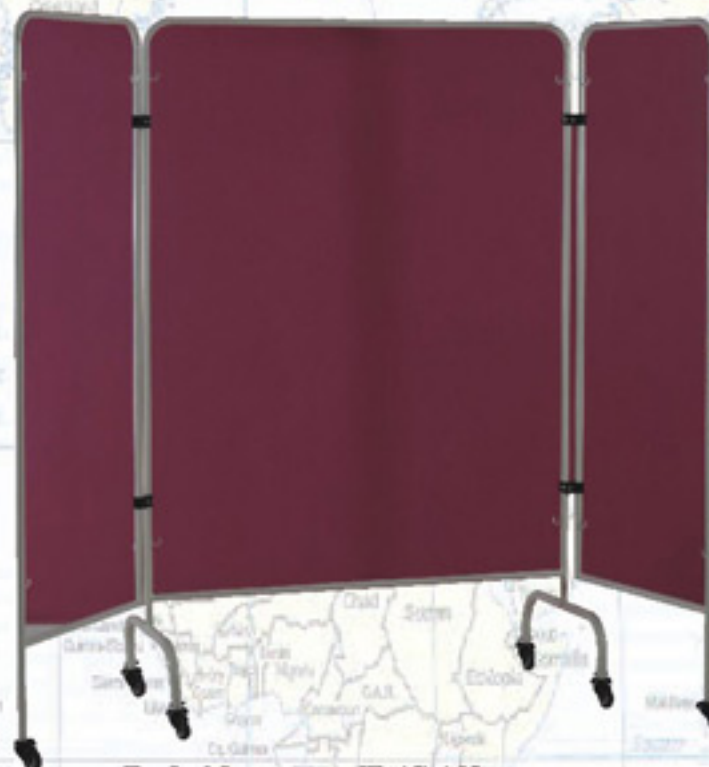
Bed side screen [D4S 13]

Overall Size : L Open 2360 mm / close 1200 mm x W 550 mm x H 1730 mm