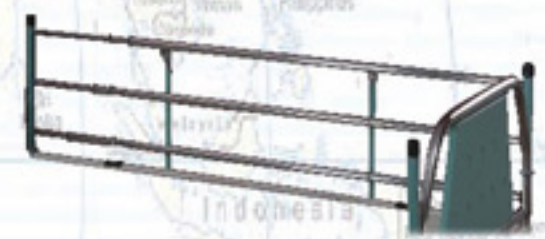
S.S. COLLAPSIBLE RAILING