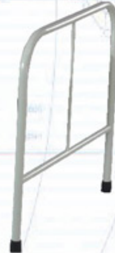
M.S. POWDER COATED BOWS

D 4 SURGICALS...GLOBAL VISION FOR THE PATIENT'S COMFORT