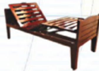
Backrest + Legrest Position

D 4 SURGICALS...GLOBAL VISION FOR THE PATIENT'S COMFORT