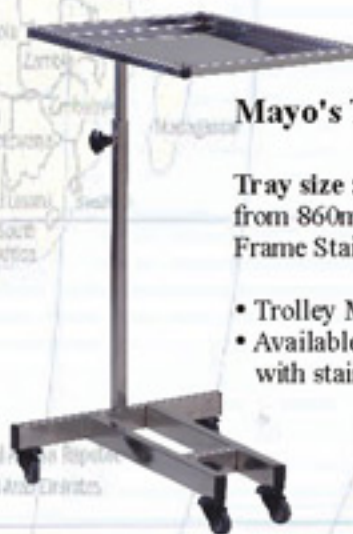
Mayo's Trolley [D4S 25]

Tray size : L 555mm x W 430mm x Ht. adjustable from 860mm to 1300 mm Frame Stainless steel rectangular and square tubes