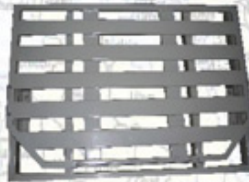
TRAPEZOID TYPE TOP