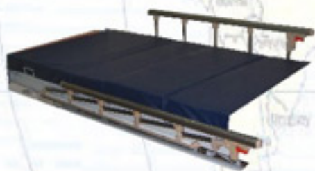
ALLUMINIUM COLLAPSIBLE RAILING