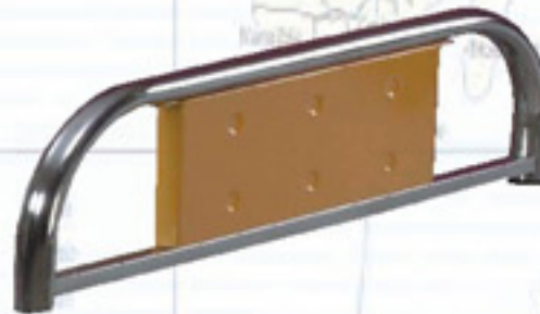
S.S. METAL BOWS