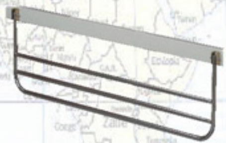
S.S. SWING TYPE RAILING