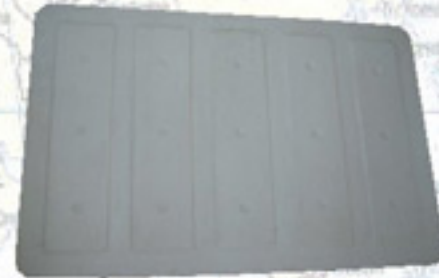
ABS PLASTIC TOP