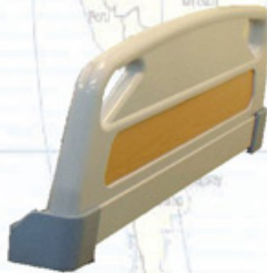
ABS PLASTIC BOARDS