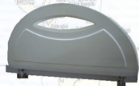
ABS PLASTIC SWING TYPE RAILING