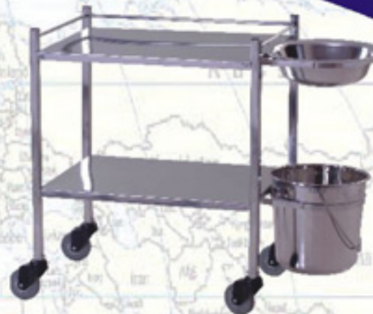
Dressing Trolley with Bowl and Bucket [D4S 35]

Overall Size : L 1080mm x B 460 mm x H 830 mm Frame Stainless steel square tubes