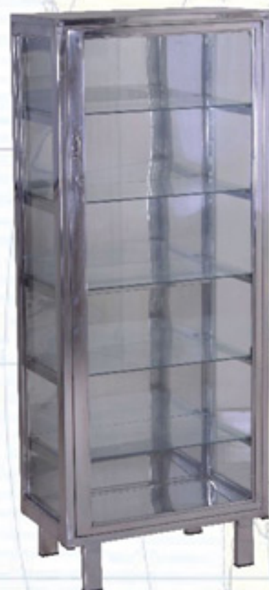
Instrument Cabinet [D4S 30]

Overall Size : W 610 mm x D 355 mm x H 1525 mm Frame : CRCA Rectangular tube, CRCA sheet panels