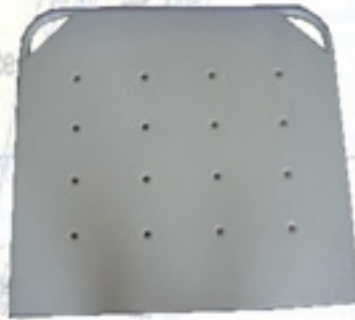
PERFORATED SHEET TOP