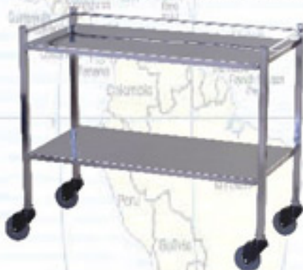
Instrument Trolley [D4S 24]

Stand available in stainless steel / epoxy powder coated