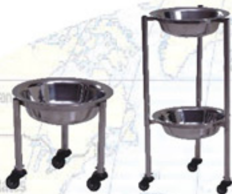
Kick Bucket and Bowl Stand [D4S 27]