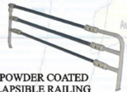
M. S. POWDER COATED COLLAPSIBLE RAILING

SELECT THE REQUIRED PARTS OF THE BED AND FORWARD US BY EMAIL, FAX AND WE WILL QUOTE YOU THE PRICES ASAP.